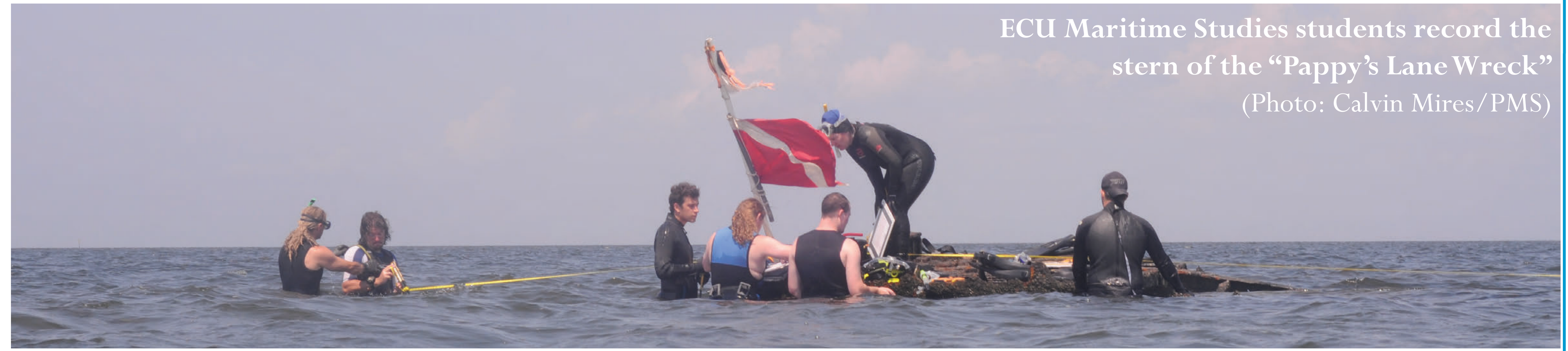
ECU Maritime Studies students record the stern of the “Pappy’s Lane Wreck”

This unidentified ferrous-hulled (probably steel), oyster-shell encrusted shipwreck first appears on NOAA and Coast Guard nautical charts in 1969 (above).